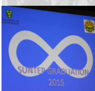
Congratulations to all 34 SUNTEP students who graduated with Bachelor of Education degrees this year